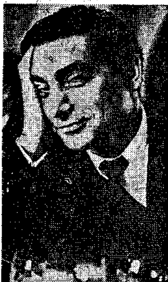
The late Robert Capa, legendary war photographer who covered five wars in 18 years and was killed by a land mine in Indo-China on May 25, 1954. His retrospective exhibition opens Friday at the Art Museum.

Sixty-five outstanding examples of American folk art that flower-