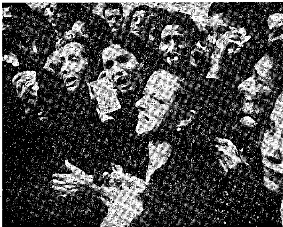
Mothers of Naples lament their sons' deaths. Their children were killed in guerilla fighting with the Germans in October, 1943. Photograph is in the exhibition of war pictures by Robert Capa in the Art Museum.